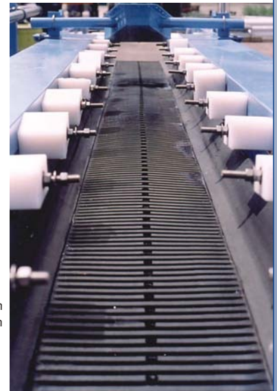
Belt Filter Vacuum System