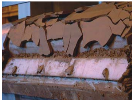
Belt Filter Vacuum System